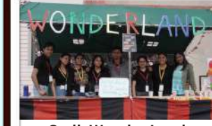
Stall: Wonder Land