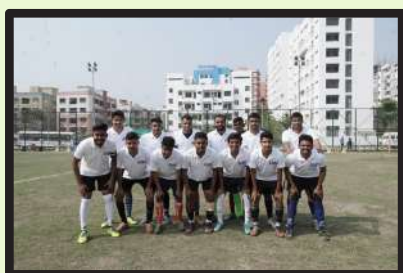
AIMK Football Team First Runner-Up ELEGANTE, IIM Bodh Gaya Held on 22 nd January 2023