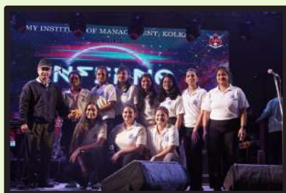
AIMK Kabaddi Girls Team First Runner-Up Chakravyuh, AIMK Held on 30 th January 2023