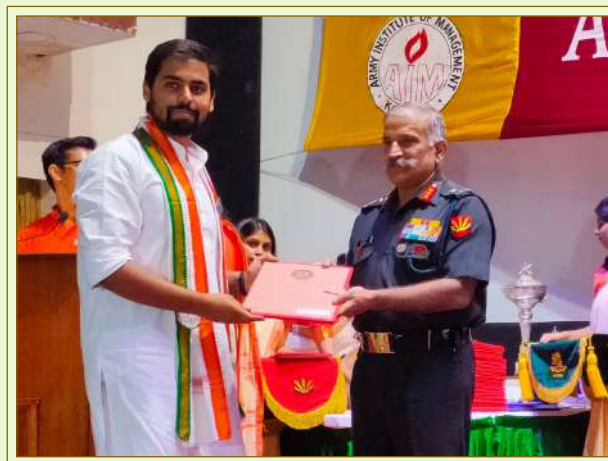
Medal Award Function, 2019