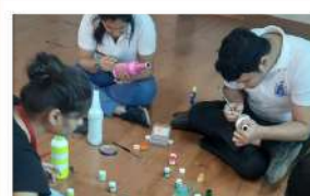
Bottle Painting Contest