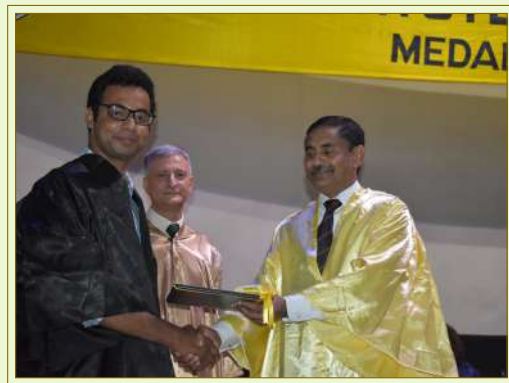
Medal Award Function, 2018