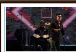
Battle of Bands