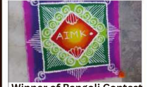
Winner of Rangoli Contest