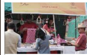
Stall: Stop & Shop