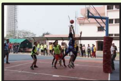
AIMK Basketball Team First Runner-Up Chakravyuh, AIMK Held on 30 th January 2023