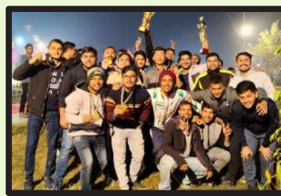
AIMK Volleyball Team Winner ELEGANTE, IIM Bodh Gaya Held on 22 nd January 2023