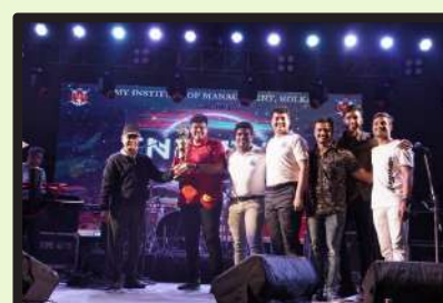
AIMK Tug of War Team Winner Chakravyuh, AIMK Held on 30 th January 2023