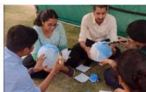
Decorators at work