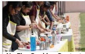
No Fire Cooking Contest