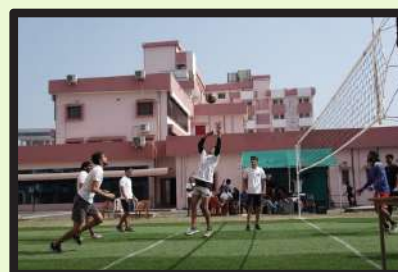
AIMK Volleyball Team First Runner-Up Chakravyuh, AIMK Held on 30 th January 2023