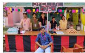
Stall: Special 26