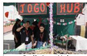
Stall: Jogo Hub