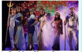
Fashion Show Contest