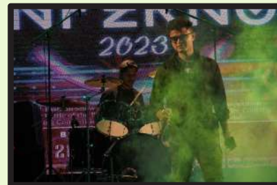
Prahara, The Band Winner Battle of Bands, Inferno, AIMK Held on 29 th January 2023