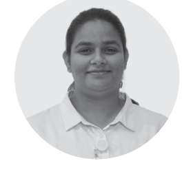
Minor - Marketing UG Degree - BCom. SIP Company - PNB MetLife India Insurance Work Experience - Fresher Career Objective -To leverage my diverse skill set and contribute to the growth of the organization.