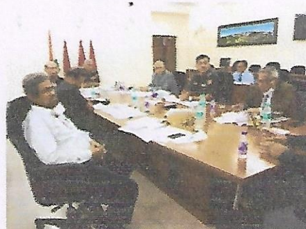
Interview for Director (AIMK) Post on 08 Nov at HQ BSA Conference Room