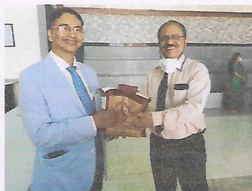
Diwali Sweet hampers distribution among Faculty & Staff after the tea party.