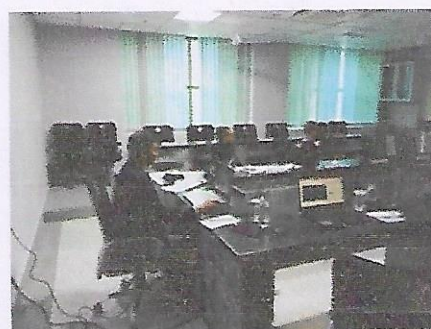
Annual Academic Meet 2021 (Virtual Mode) 12 Nov at AIMK Conference Room

5. Extended Phase for Admission Advertisement in Pan India News Paper (08 Nov). Based on AICTE notification, a fresh admission advt had been published in various newspapers across India on 08 Nov. Approval of incorporating sister defence concerns into the army category has been received from AWES HQ. Separate merit lists were prepared for Army category, sister defence category & civilian category. Total of 26 candidates have been offered admission for the session 2021-22.