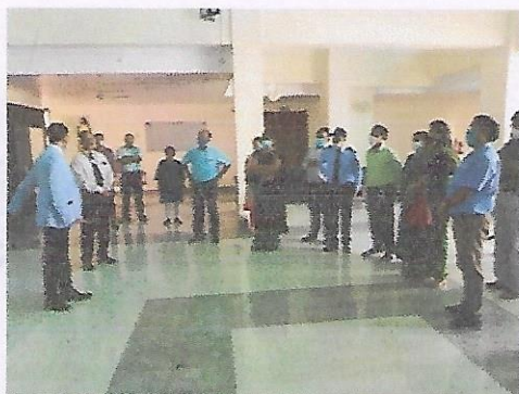
Address by Officiating Director

18. Pre- Diwali Tea Party & Distribution of Sweets (03 Nov). A pre-diwali tea party was conducted under the foyer of the Academic Block at 1100 hrs on 03 Nov. Sweets were distributed among faculty and staff at the end of the party.