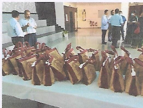
Diwali Sweet hampers