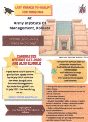
Flyer for Admissions

7. Publicity – Print Media. Ads for admission were published on 19 June in 13 prominent English & vernacular newspaper editions of prominent cities in Eastern India. This was timed in relation to a notice by the University for joint entrance examination of the state.